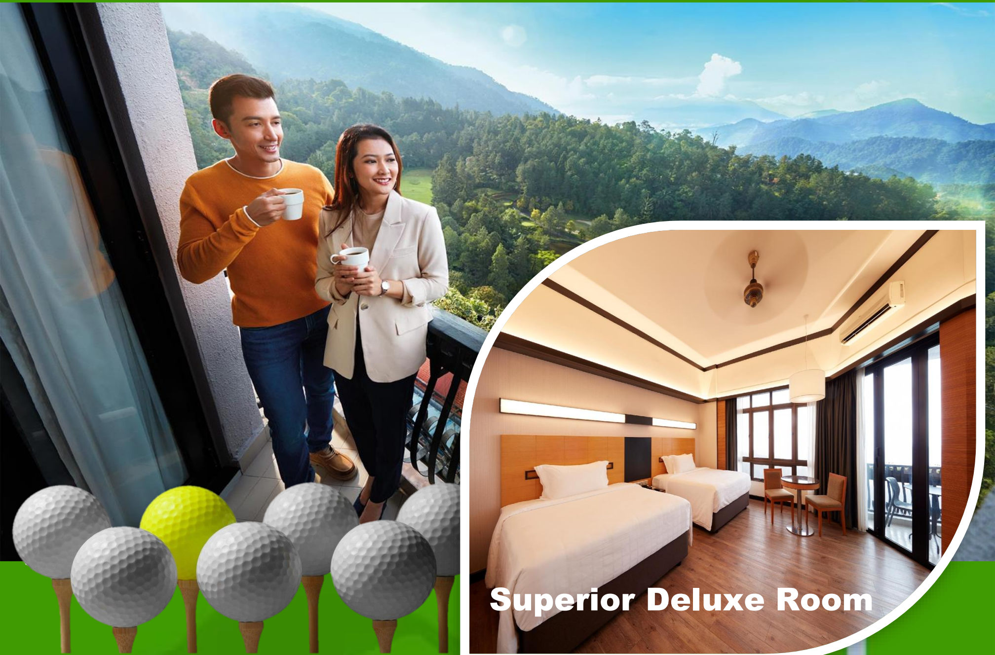
Superior Deluxe Room